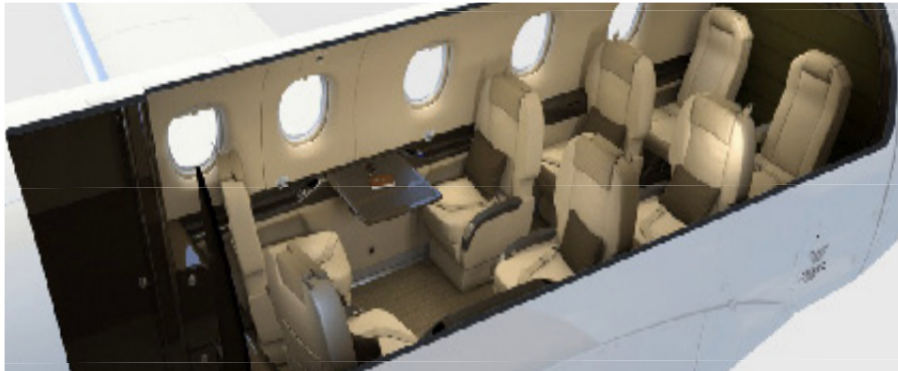
Rendering of 6 + 2 Commuter Seat Option

Cabin & Cockpit Touchscreen Entertainment Control