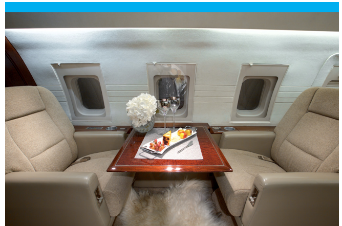
Table Seat Detail

*Specifications are subject to verification by the purchaser. Aircraft is subject to prior sale, lease and/or removal from the market without prior notice. Specifications as of May 21, 2018.