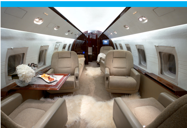
Forward to AFT Cabin