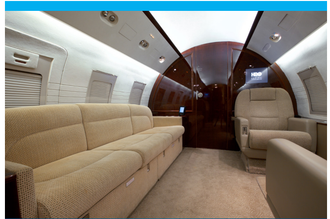
AFT Cabin Divan

*Specifications are subject to verification by the purchaser. Aircraft is subject to prior sale, lease and/or removal from the market without prior notice. Specifications as of May 21, 2018.