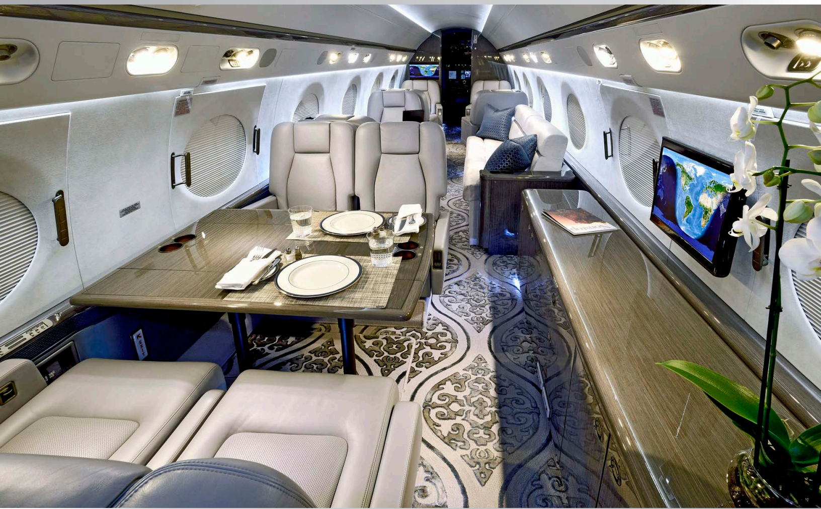
Aft cabin looking forward