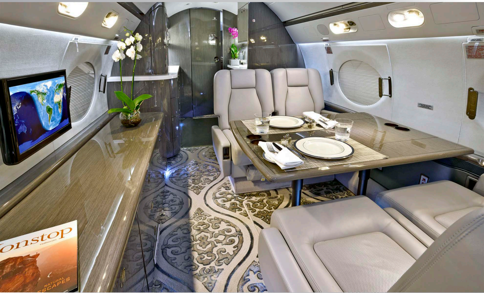
Aft cabin looking aft