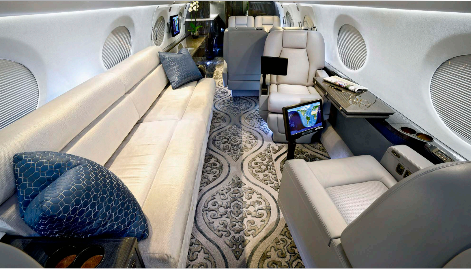
Mid cabin looking aft