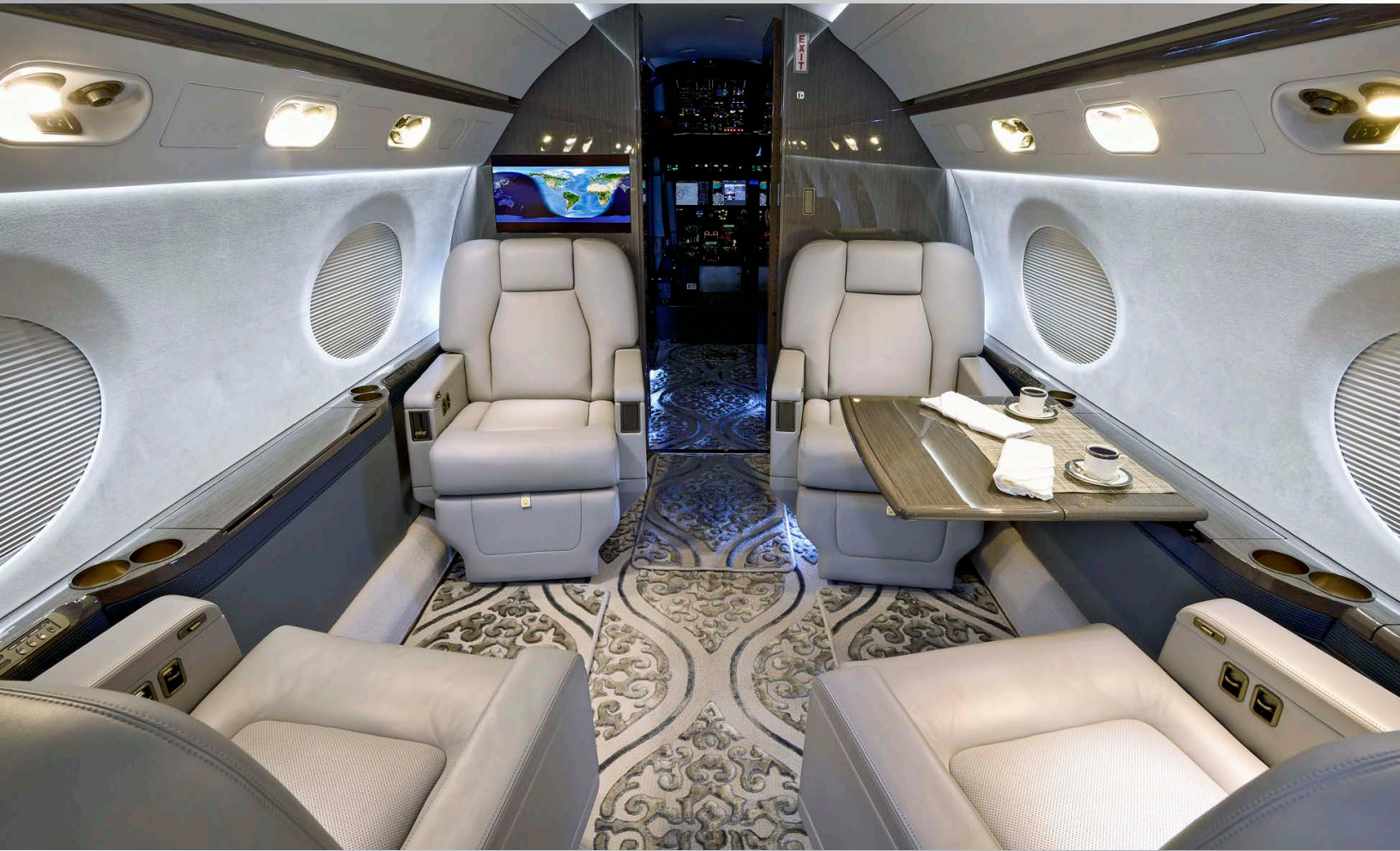
Forward cabin looking forward