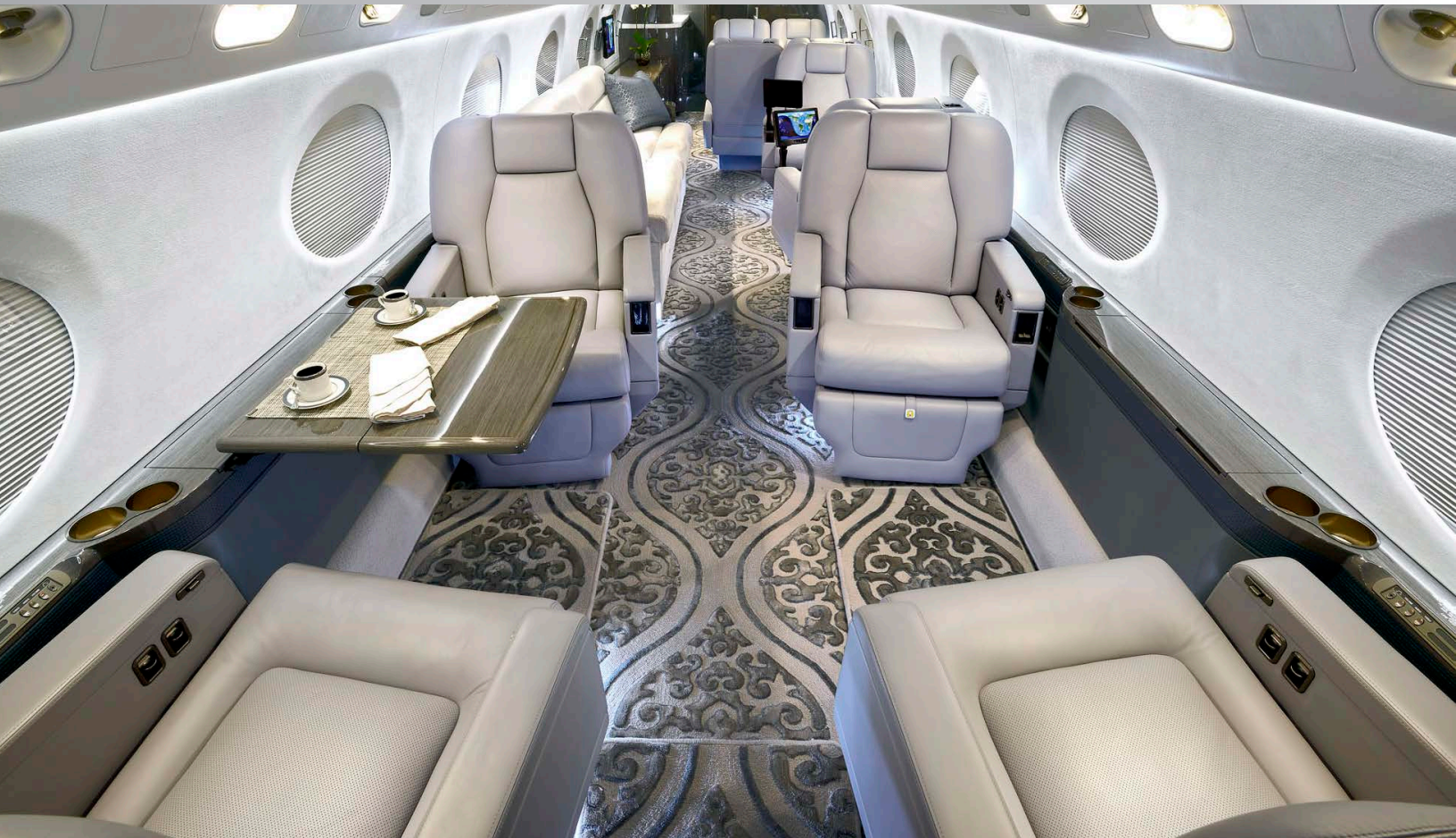
Forward cabin looking aft