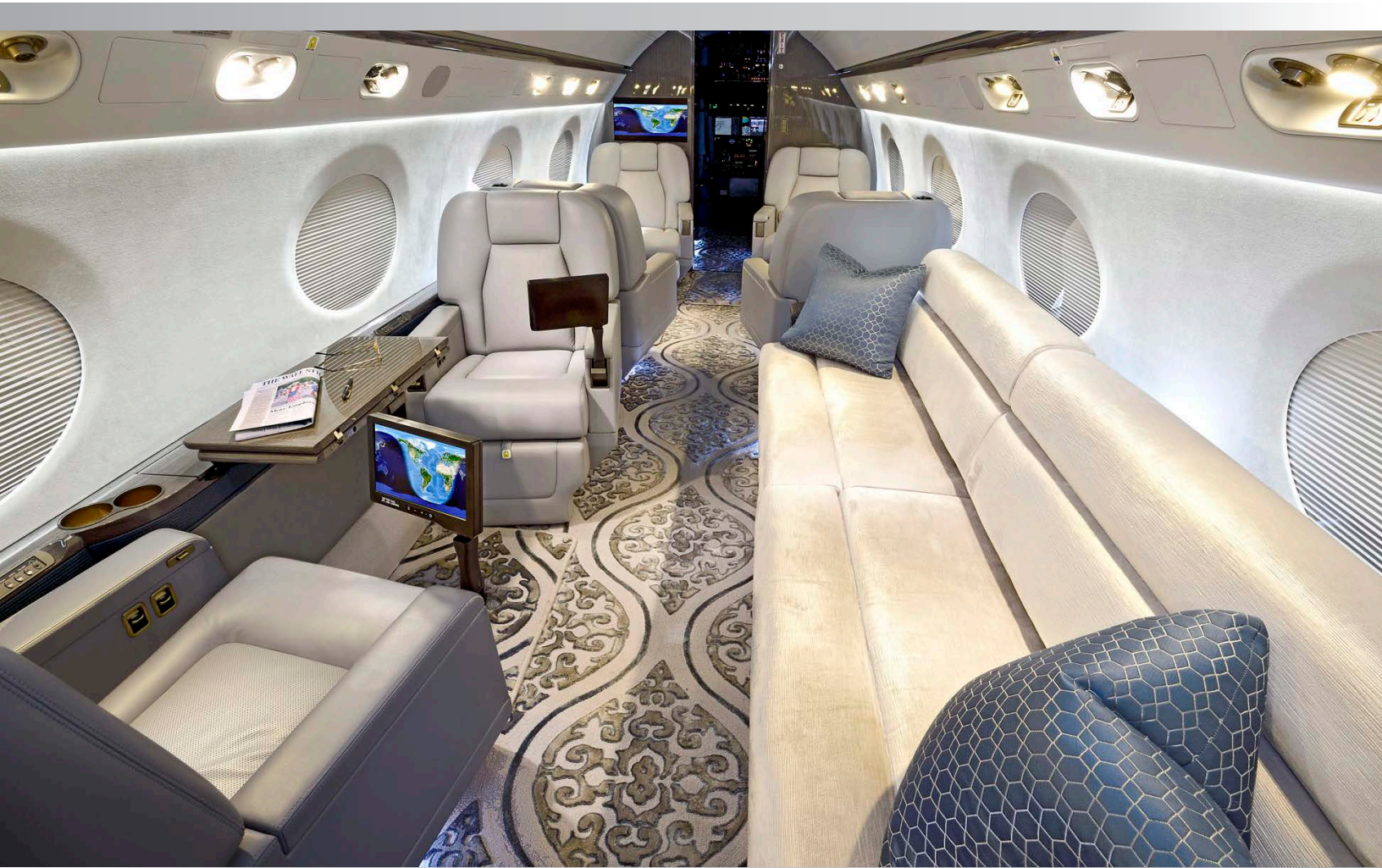
Mid cabin looking forward