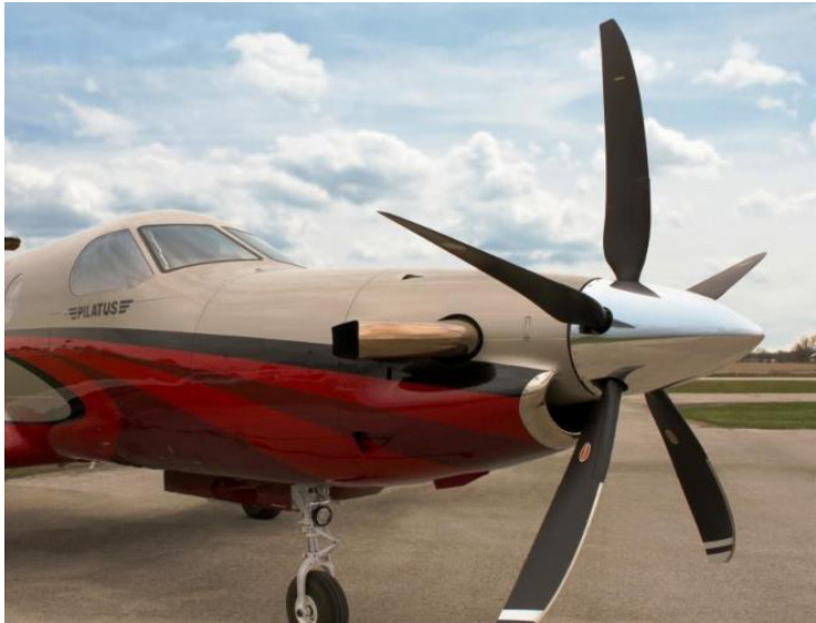
5 Bladed Hartzell Propeller

Additional Cabin Headset Jacks (BOSE) Seats 3, 4, 5, & 6