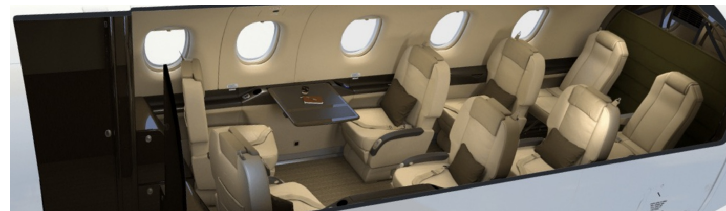
Rendering of Executive 6+2 Interior Configuration