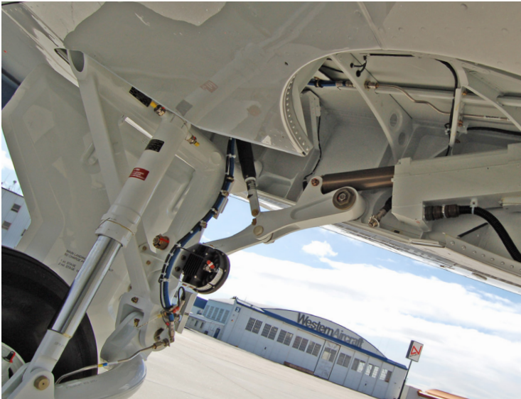
Electro-Mechanical Landing Gear