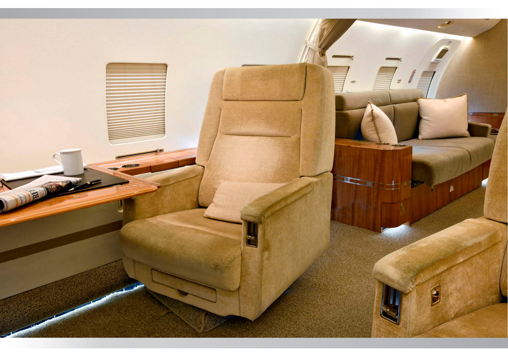
Forward cabin looking mid