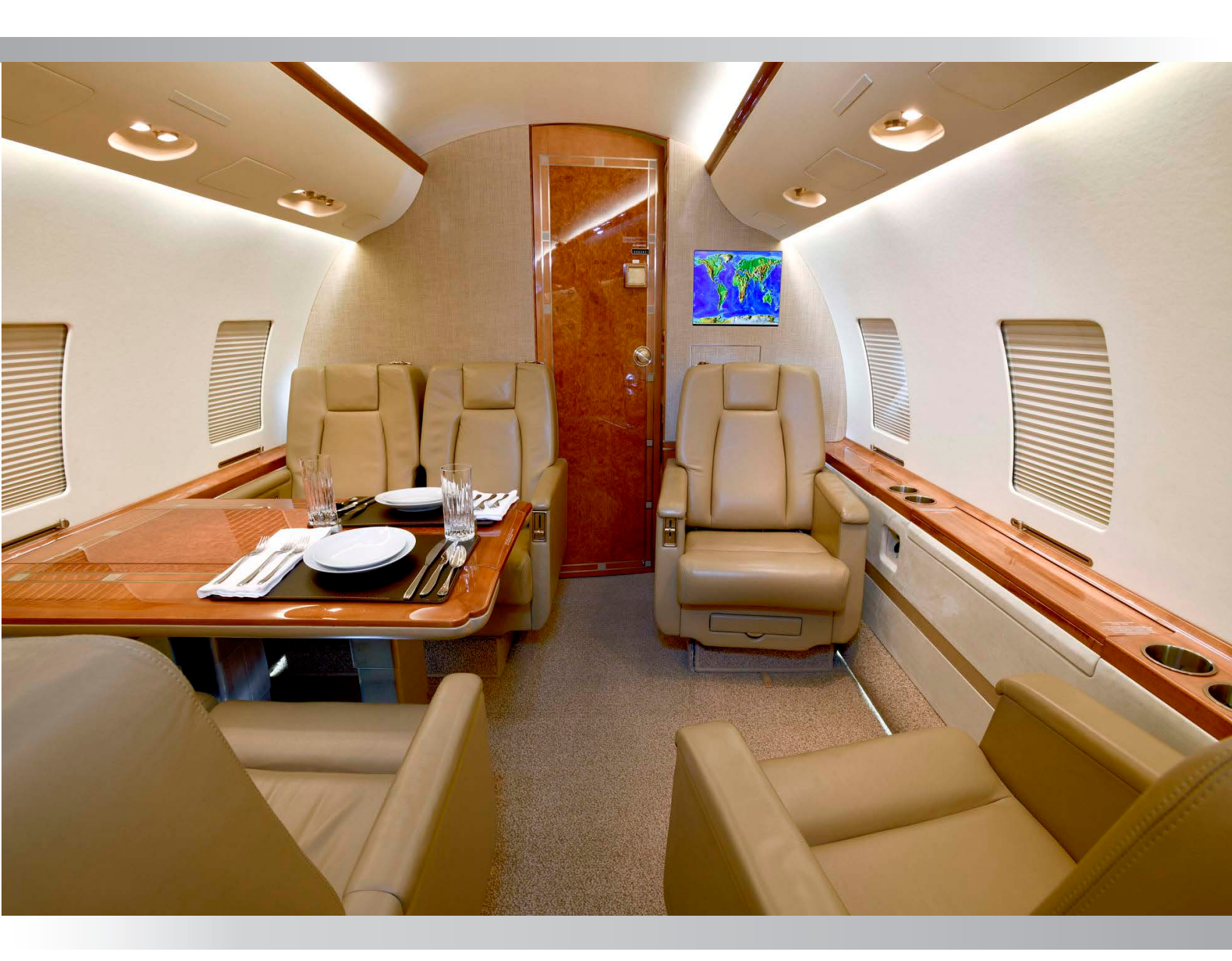
Aft cabin looking aft