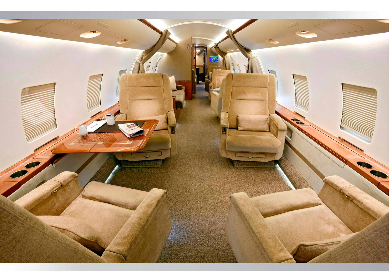
Forward cabin looking aft