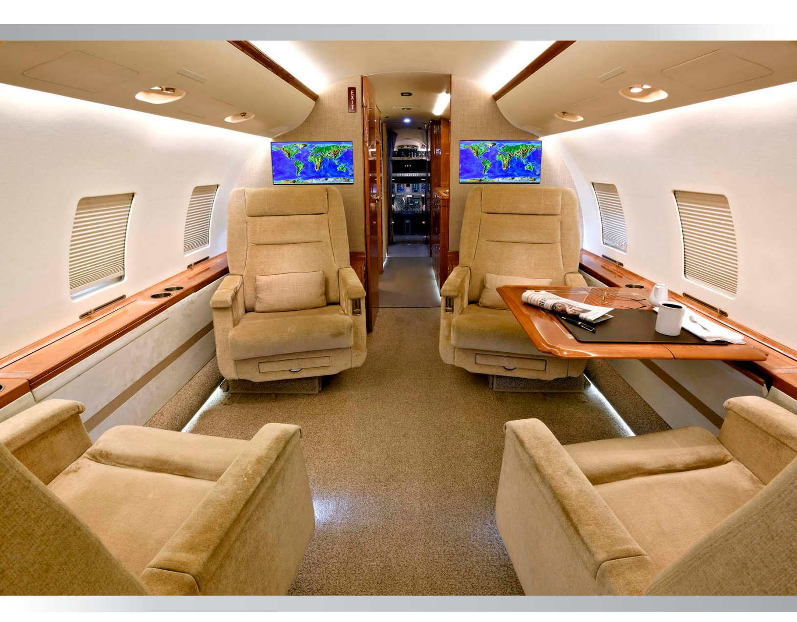
Forward cabin looking forward