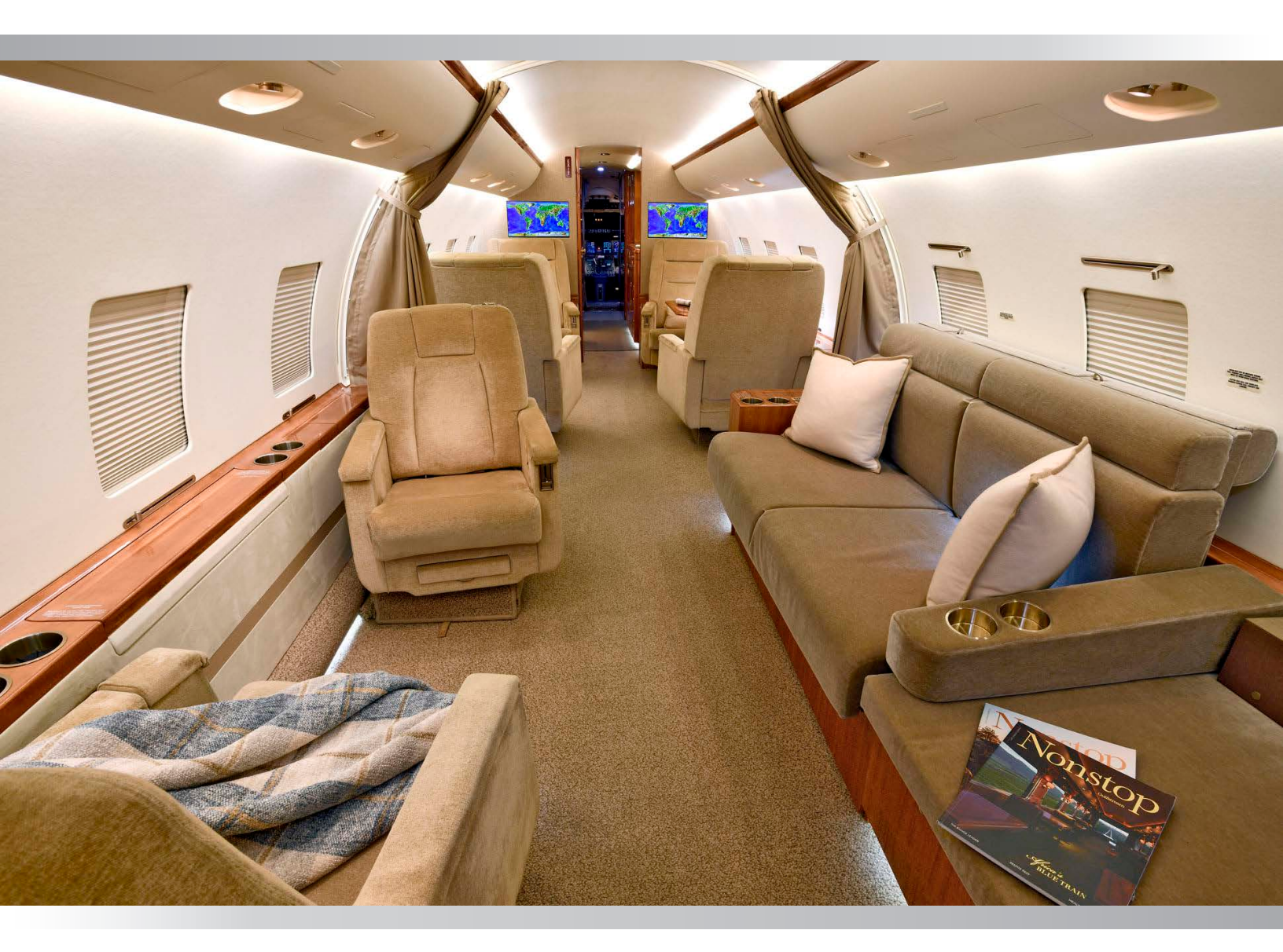
Mid cabin looking forward