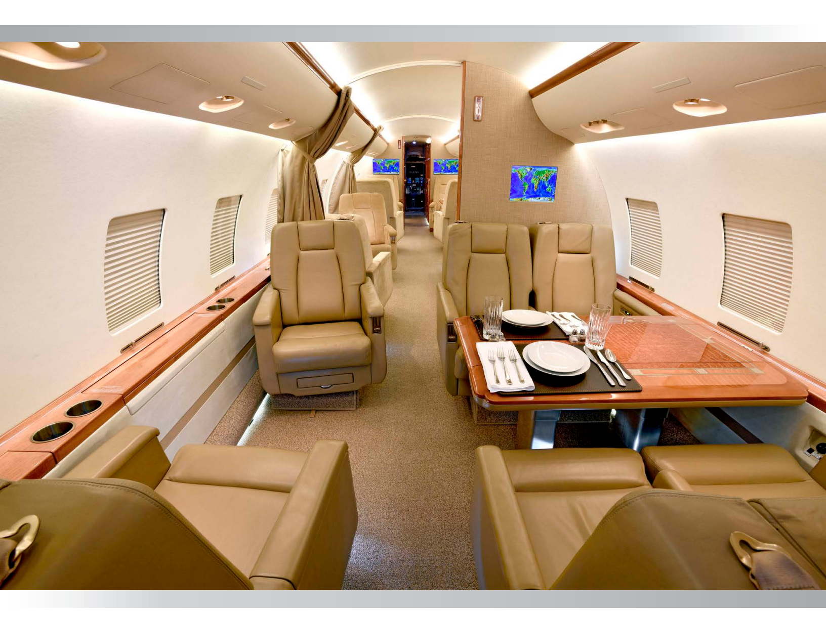
Aft cabin looking forward