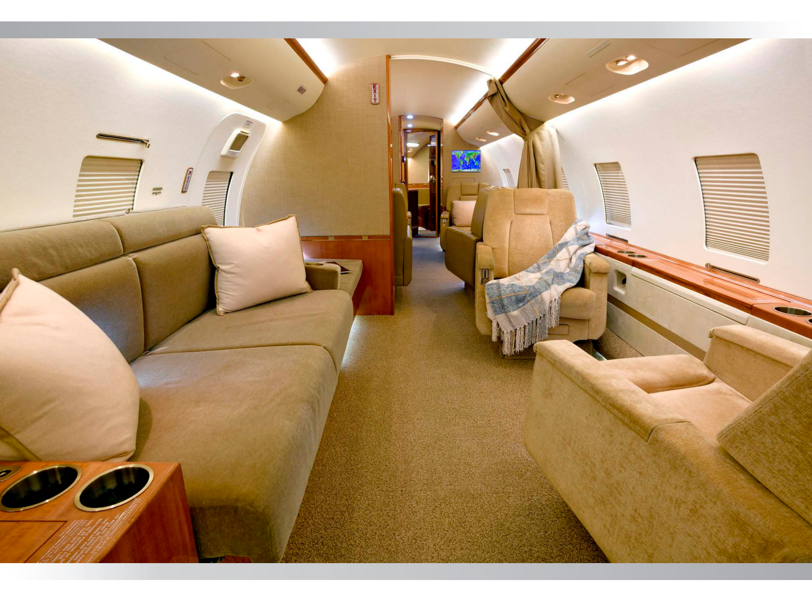
Mid cabin looking aft