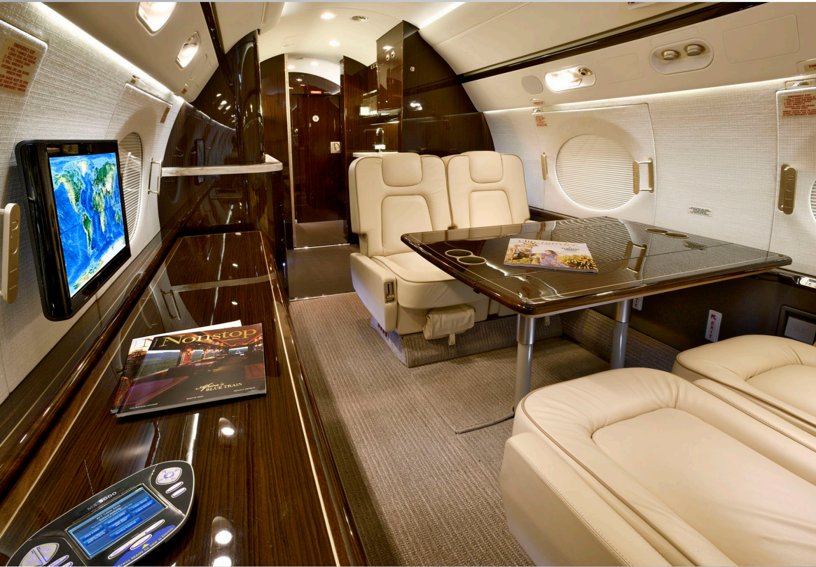
Aft cabin looking aft