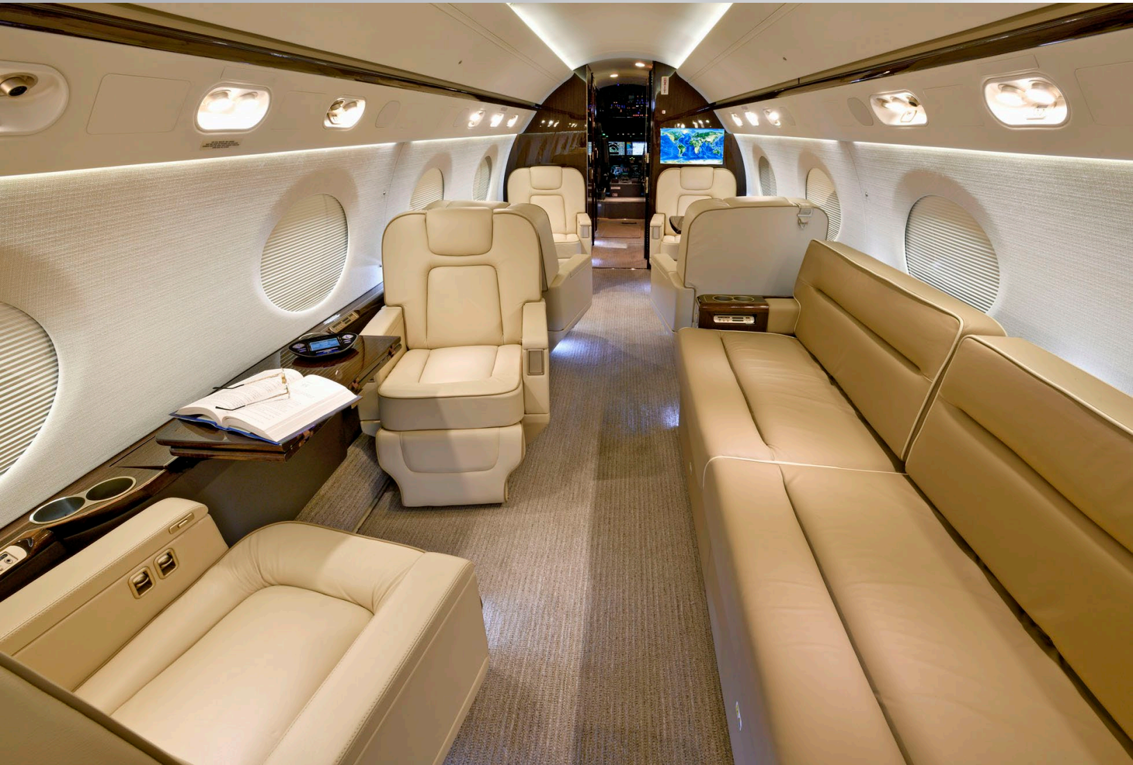
Mid cabin looking forward