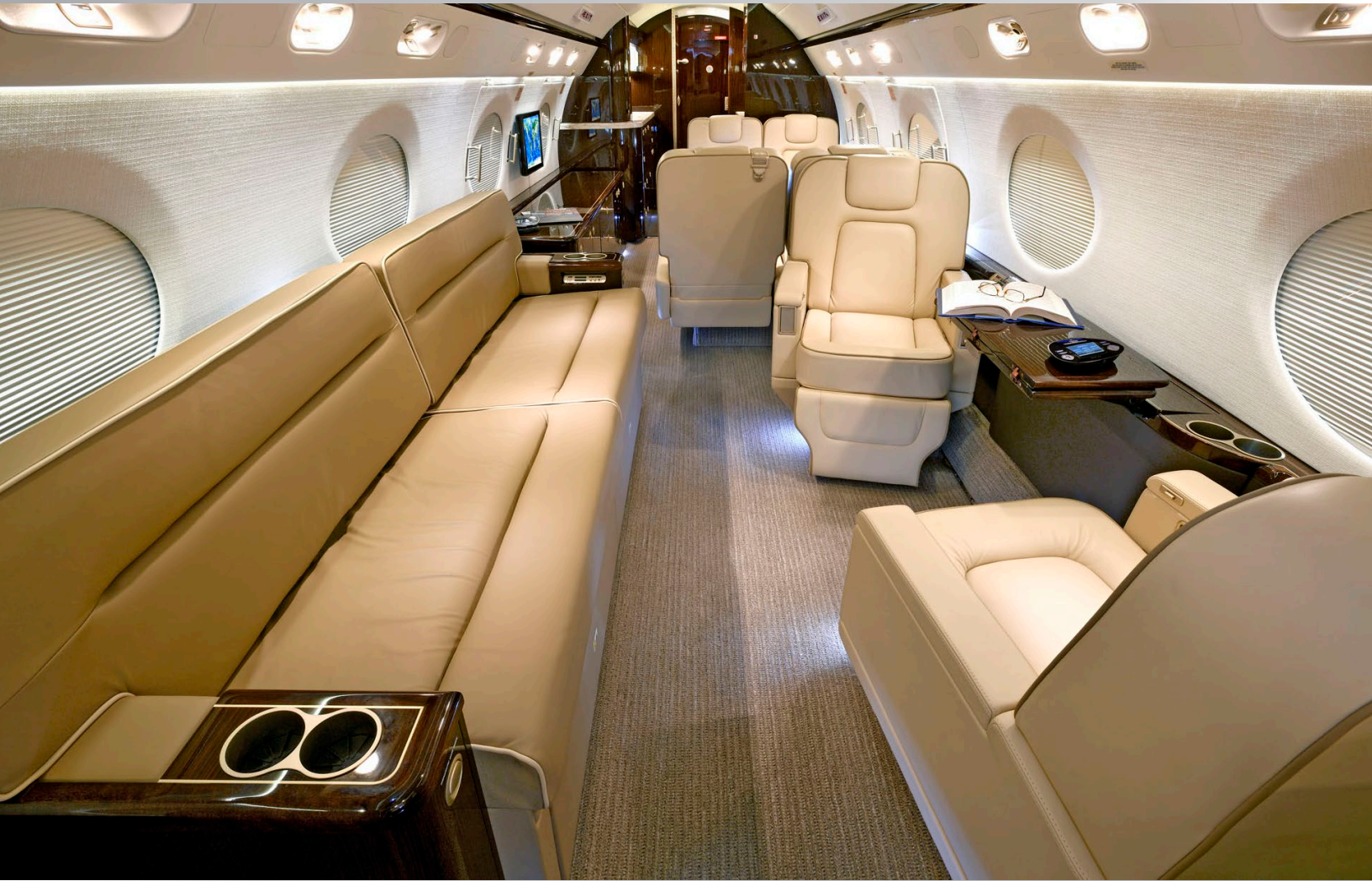
Mid cabin looking aft