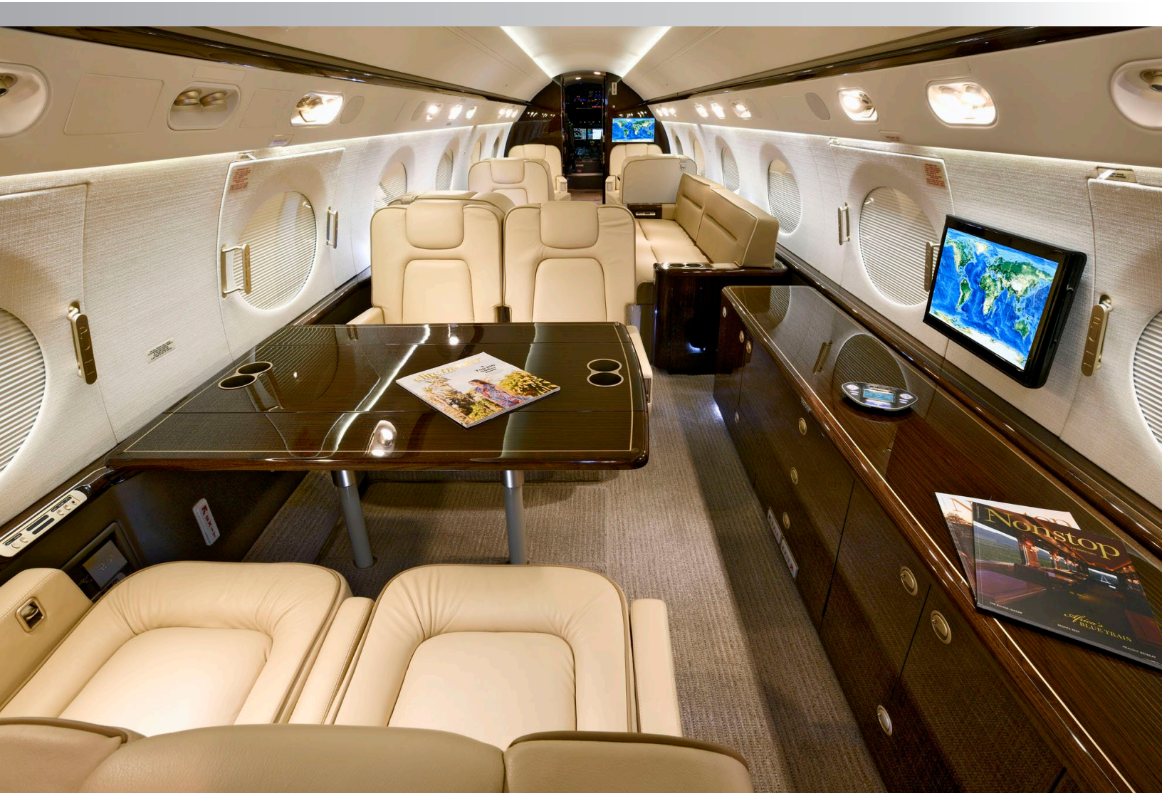
Aft cabin looking forward