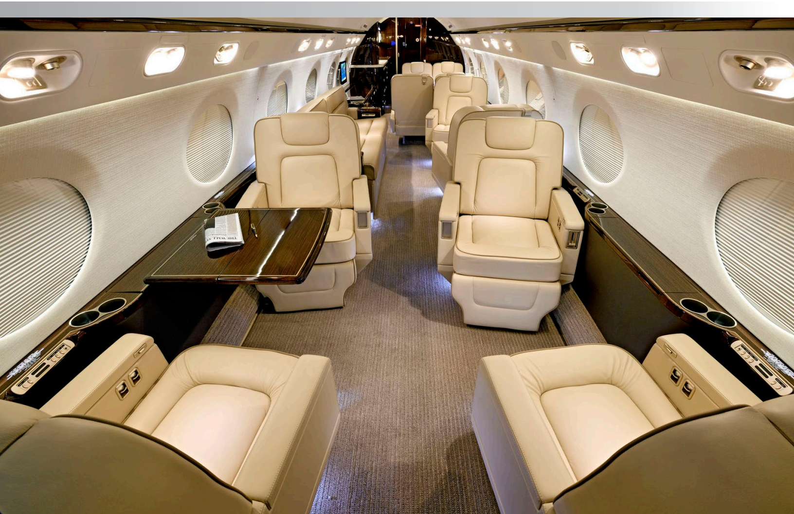
Forward cabin looking aft