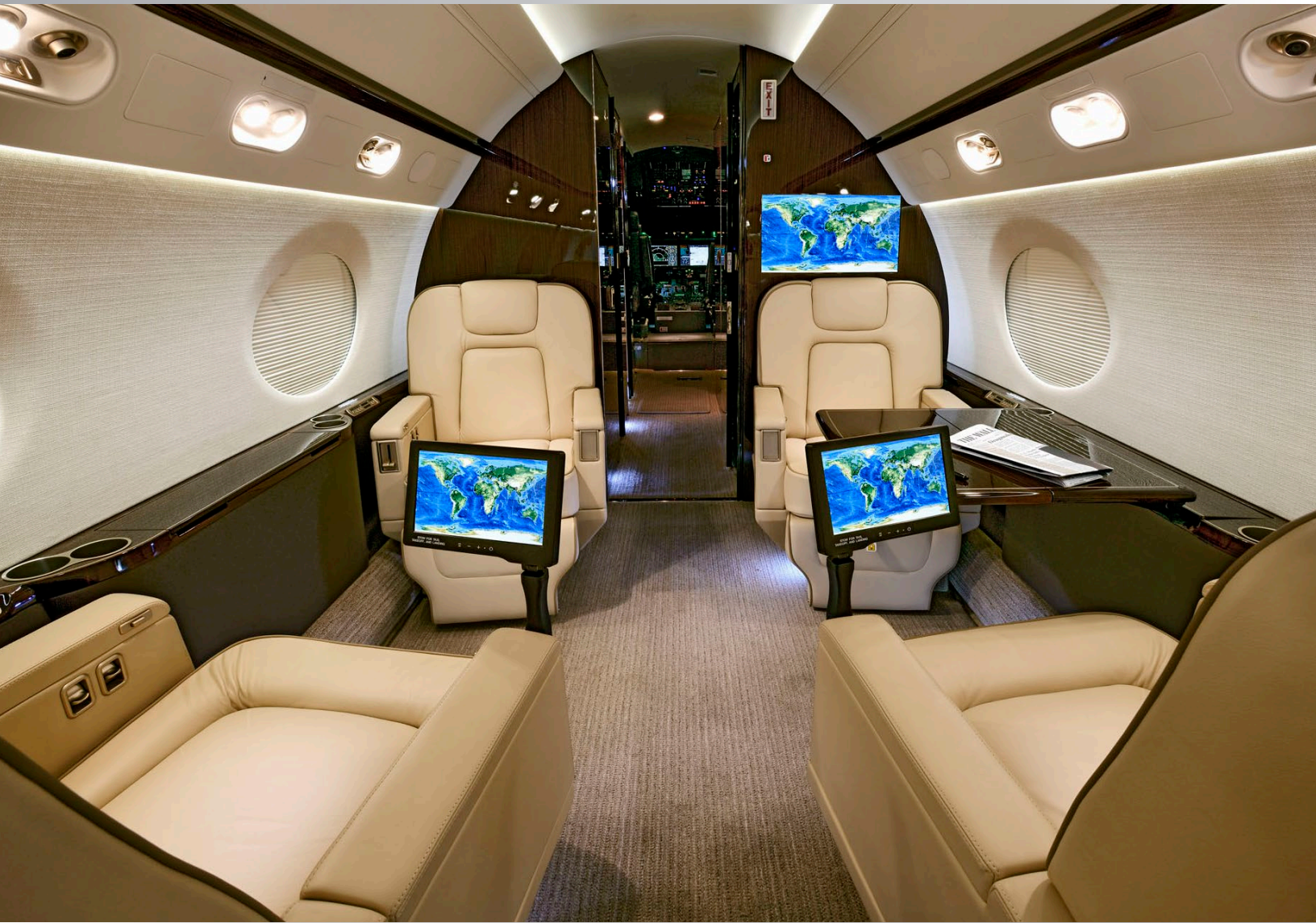
Forward cabin looking forward