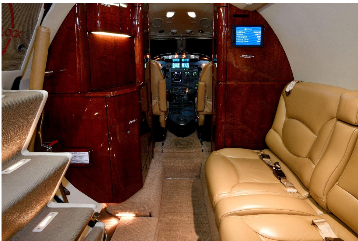
Forward Refreshment Center