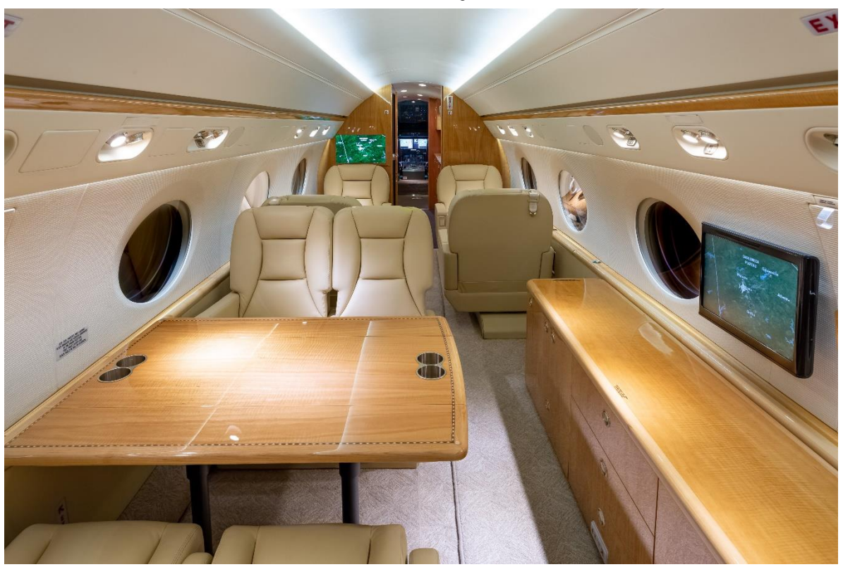
Mid Cabin looking Forward