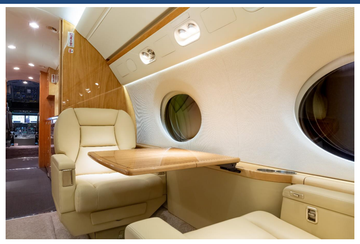
Right Hand Seat Facing Forward