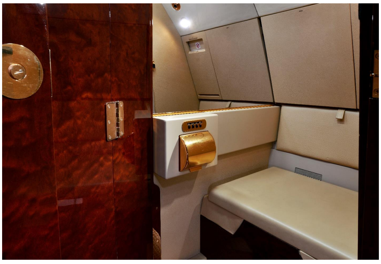
Forward Crew Lavatory