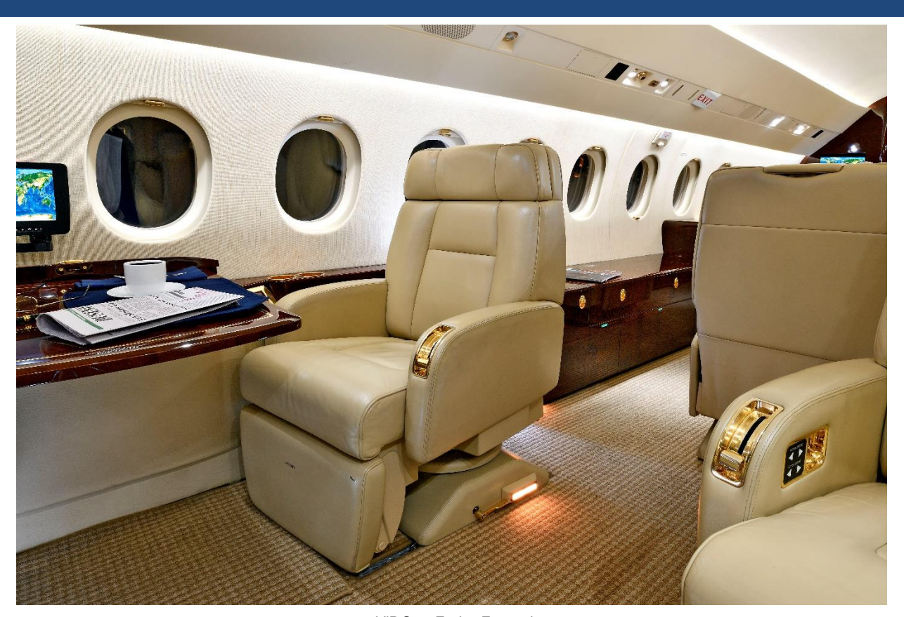
VIP Seat Facing Forward