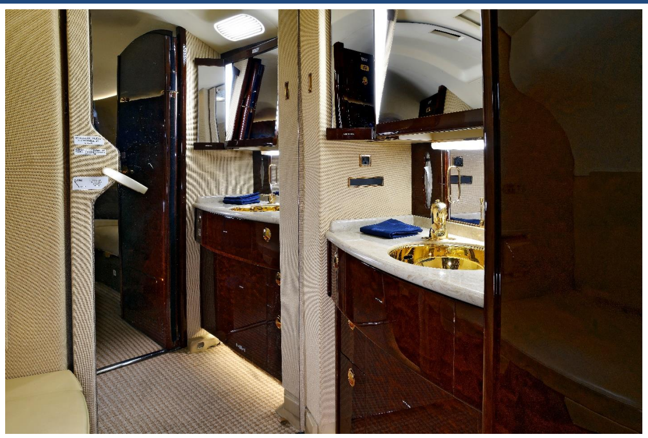
Aft Passenger Lavatory