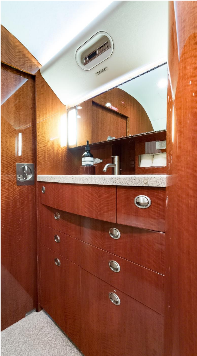
Aft Cabin Lavatory