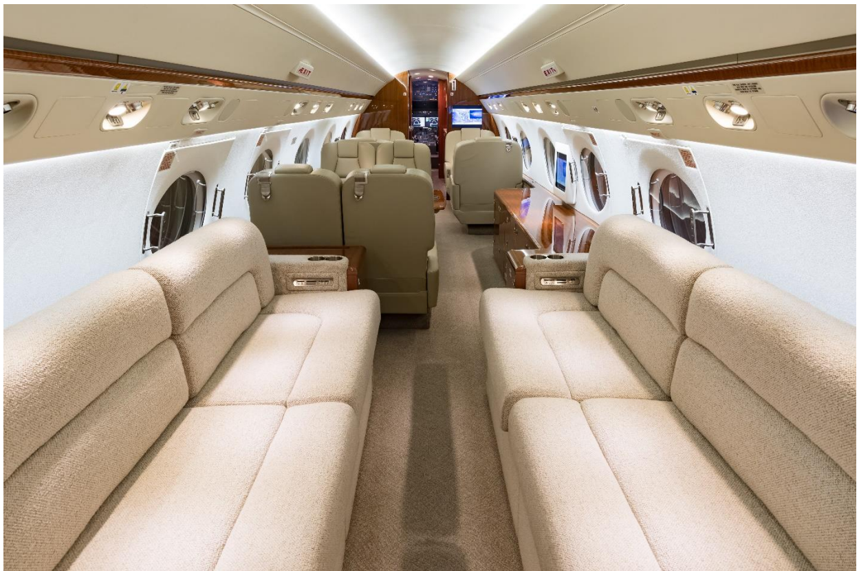
Aft Cabin looking Forward