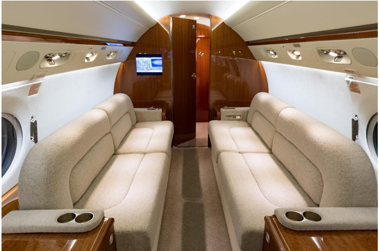
Aft Cabin looking Aft