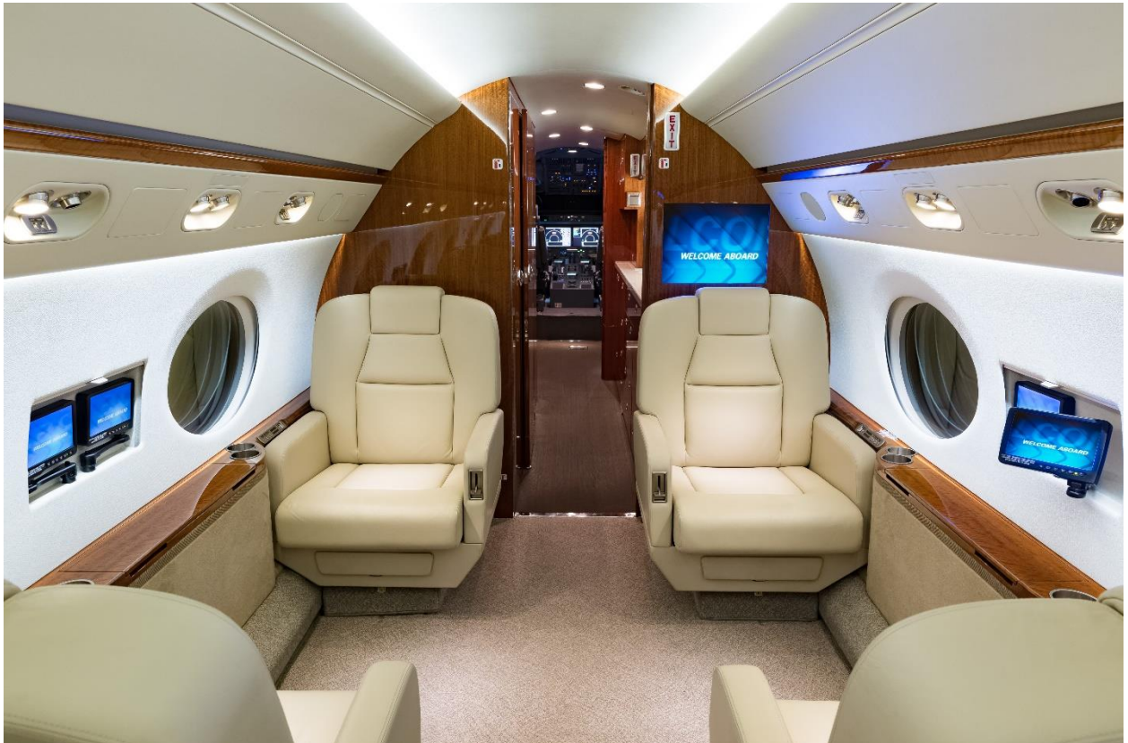
Forward Cabin looking Forward