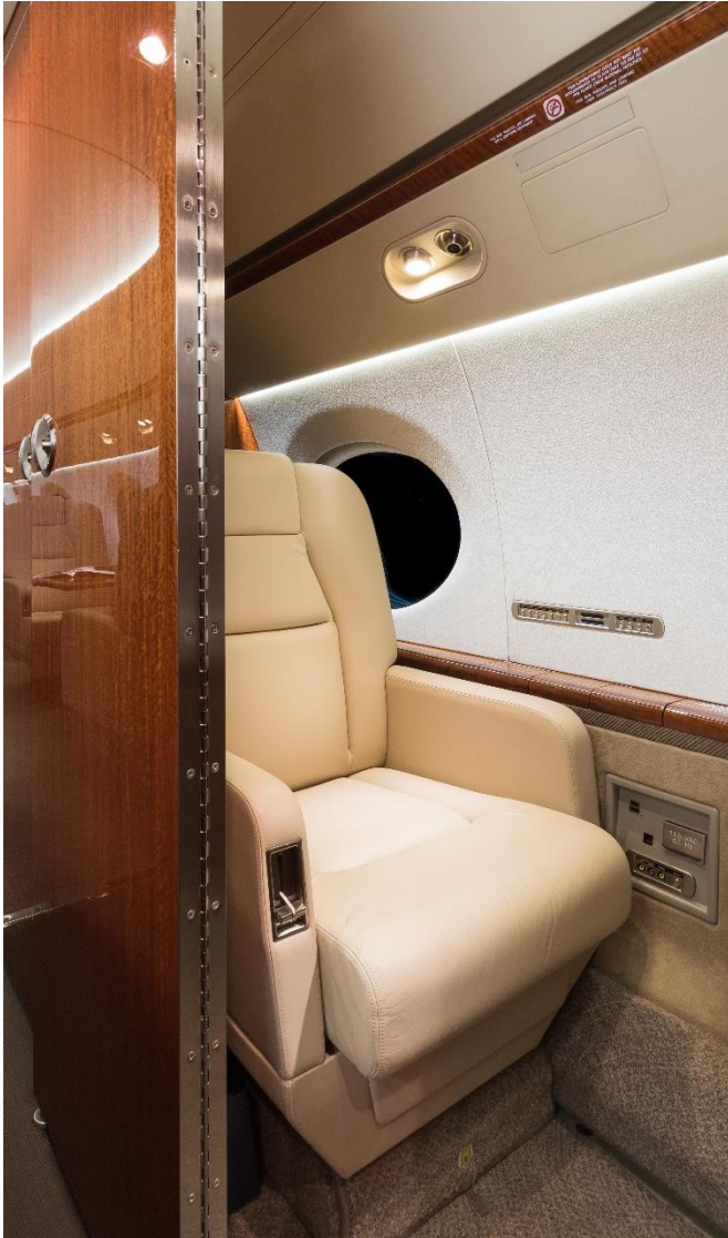
Forward Crew Rest