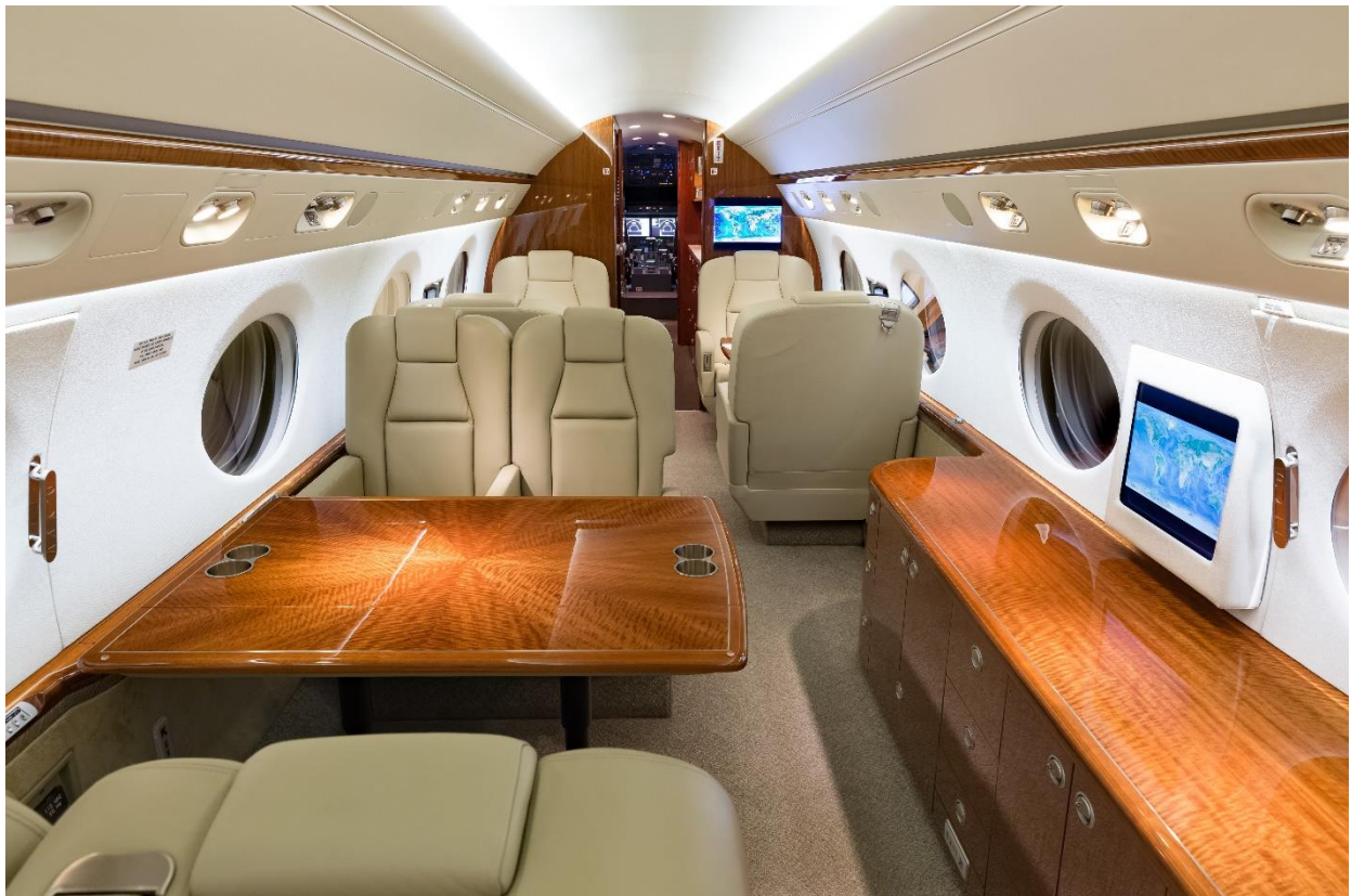
Mid Cabin looking Forward