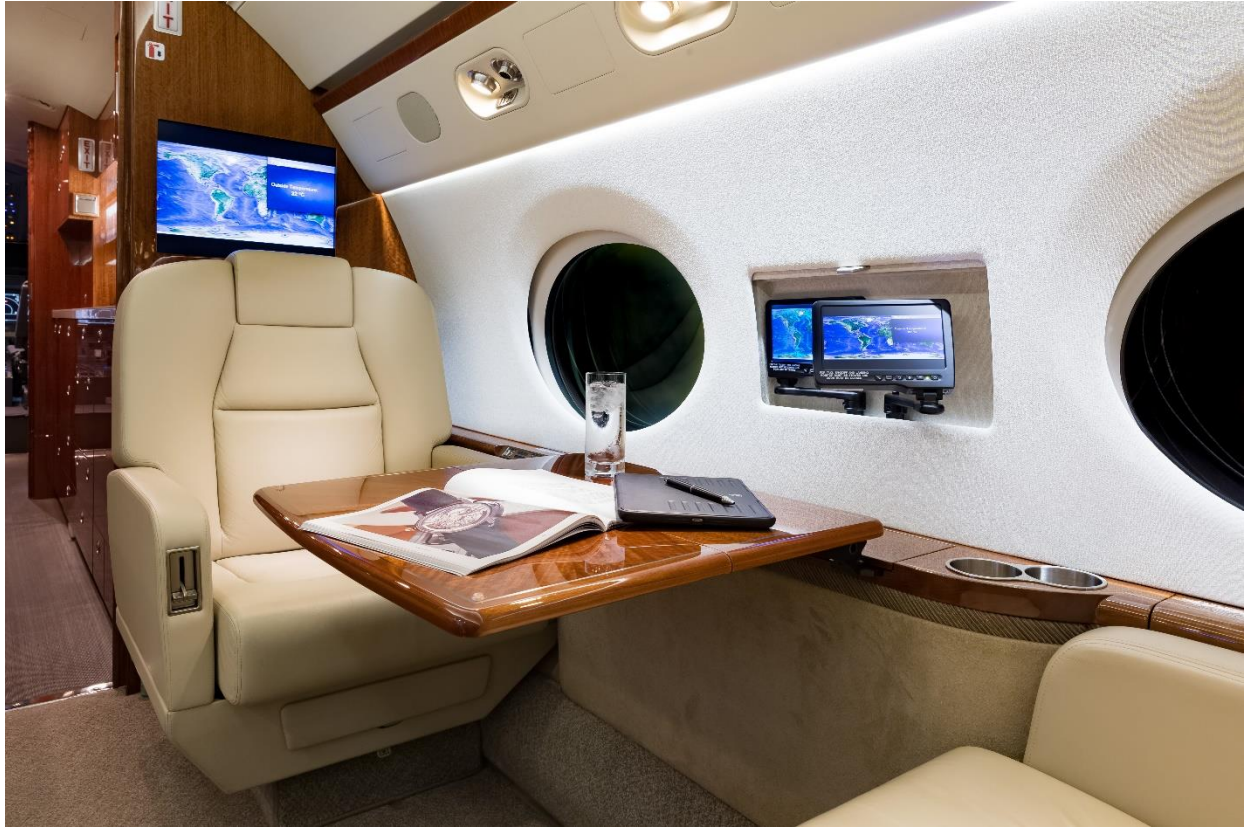
Right Hand Seat Facing Forward