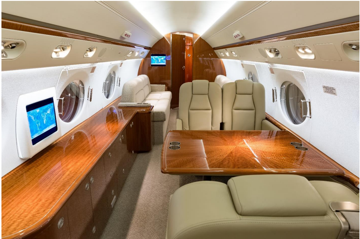
Mid Cabin looking Aft