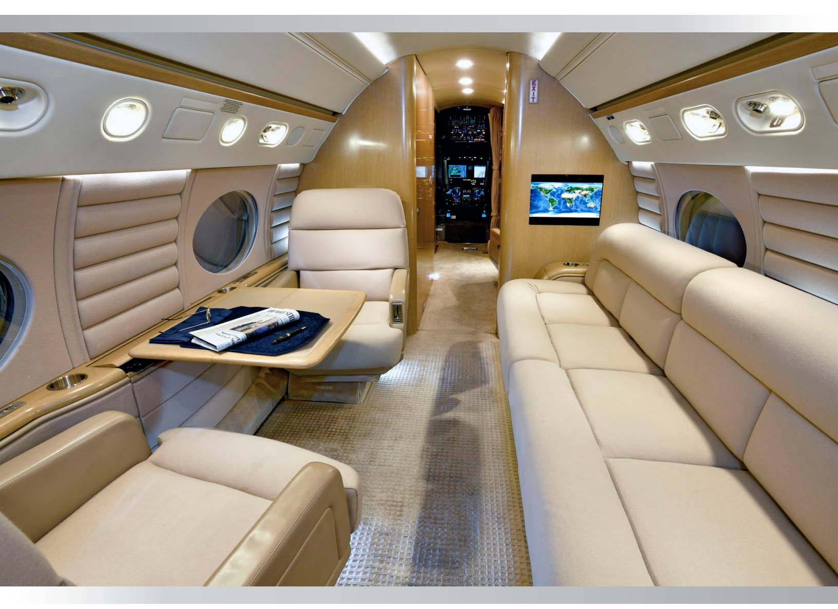
Forward cabin looking forward