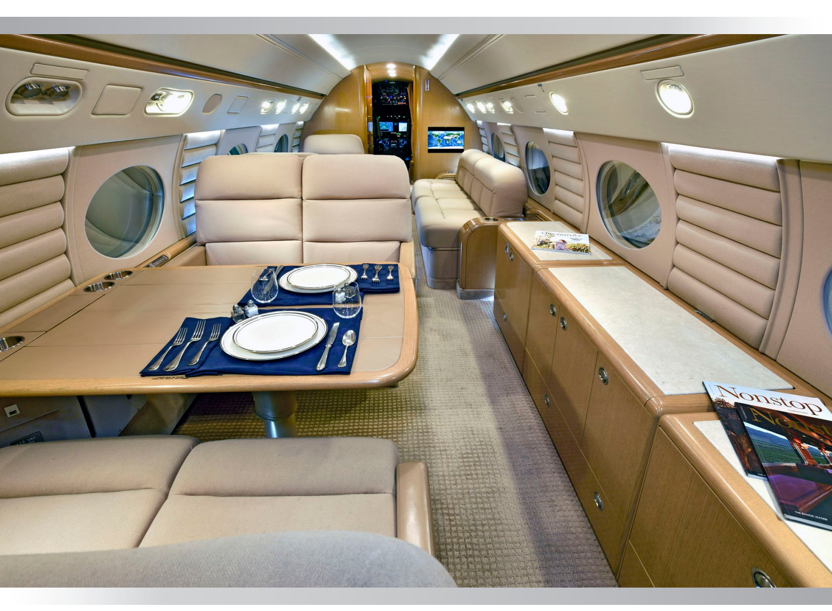
Mid cabin looking forward