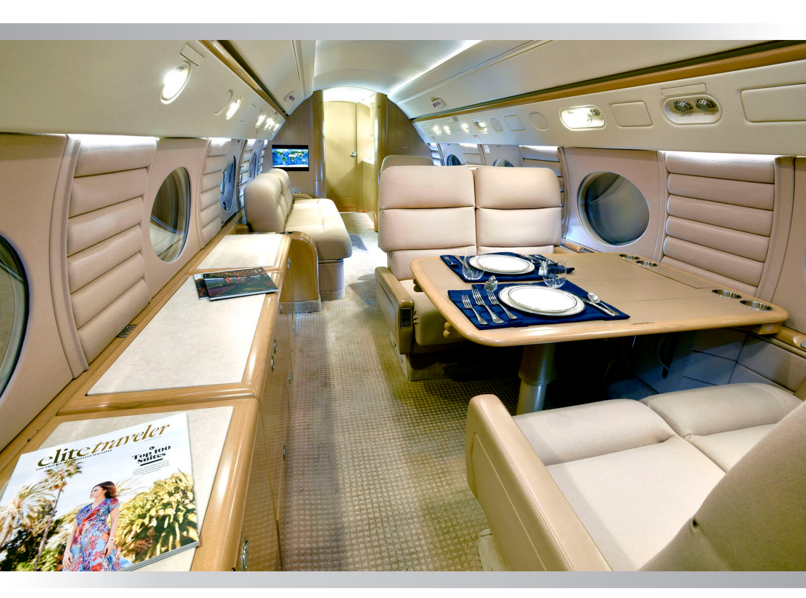
Mid cabin looking aft