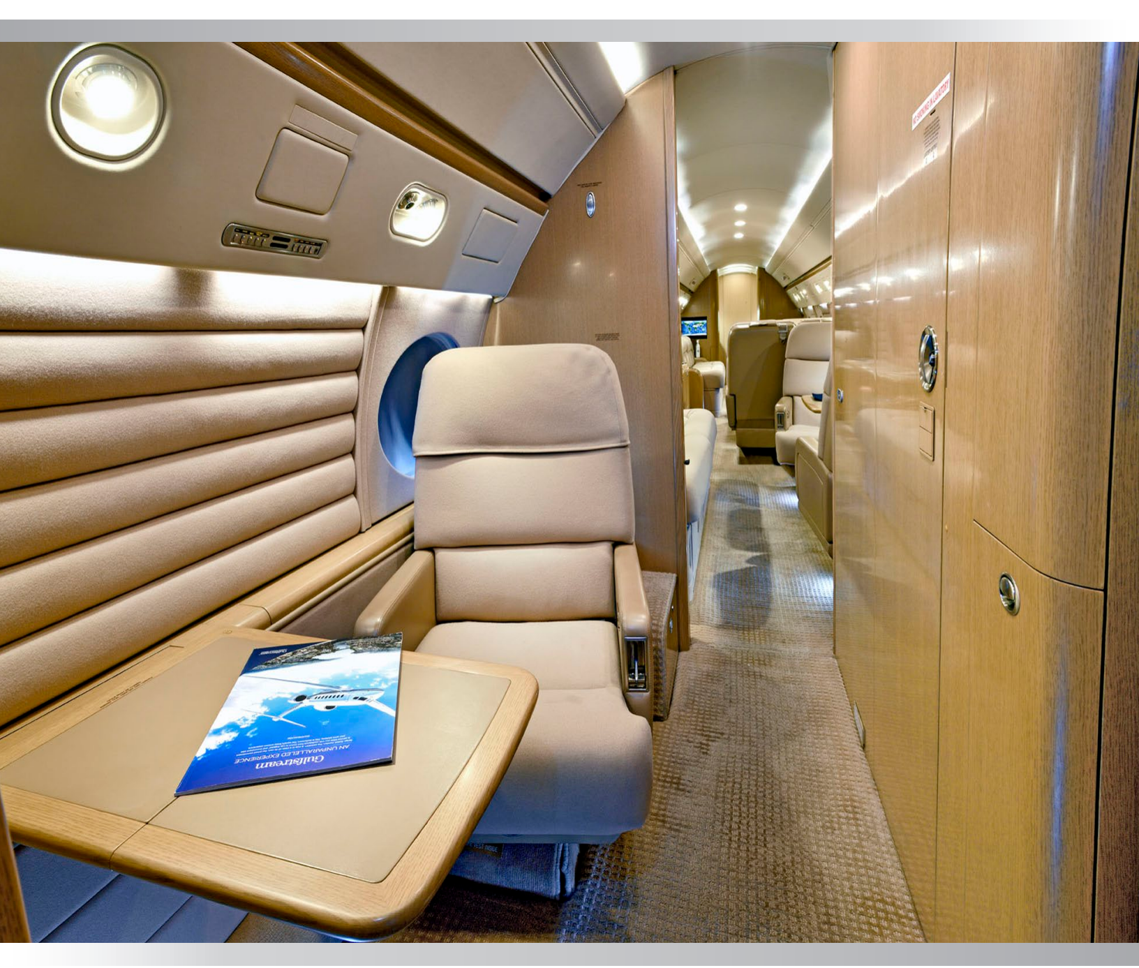
Forward Crew Rest