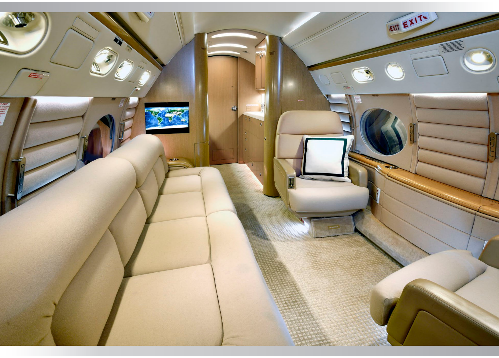
Aft cabin looking aft