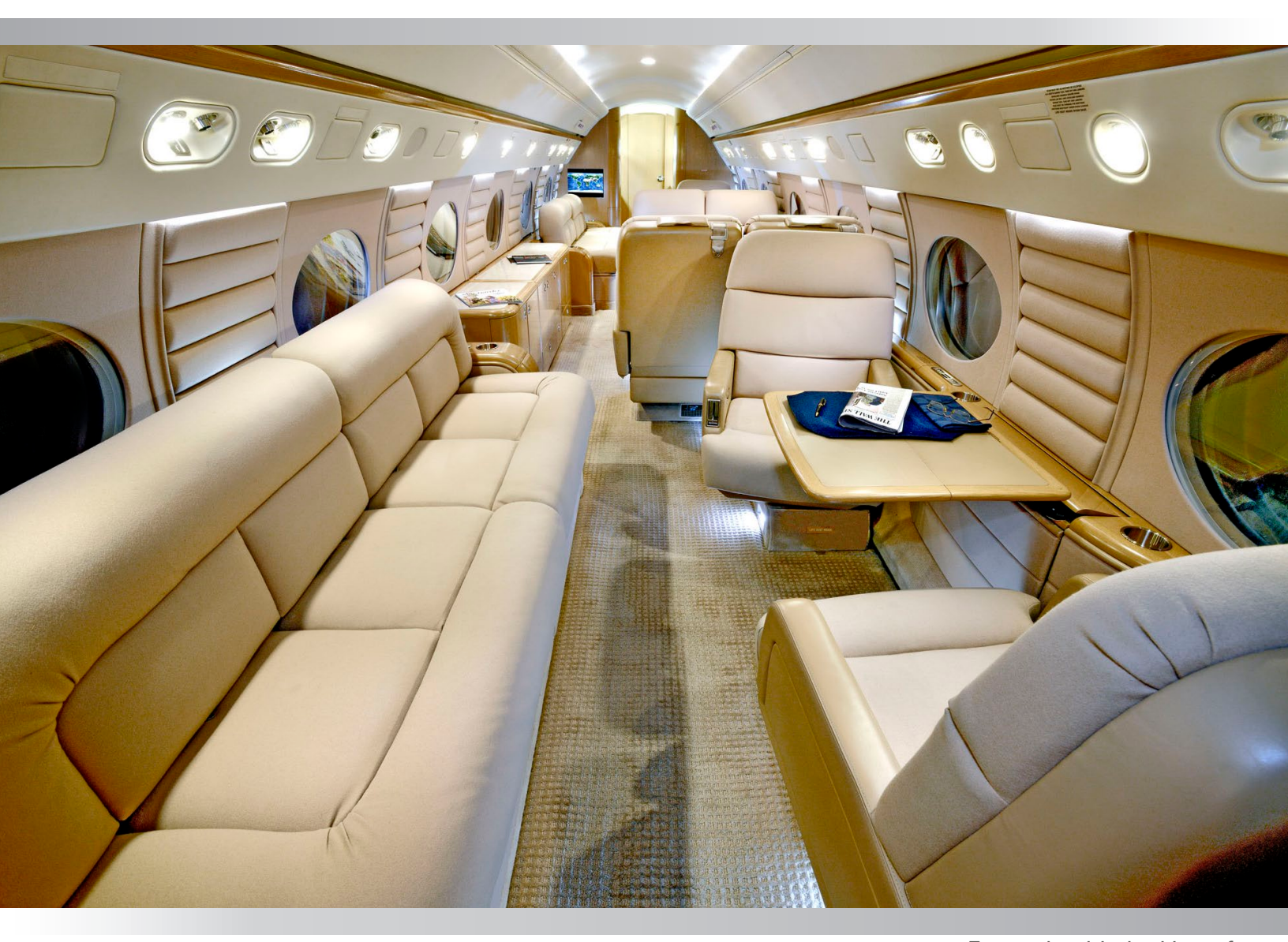
Forward cabin looking aft